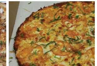
Four Chees Martguerita Pizza