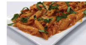
Penne alla Vodka

Rotini noodle, parsley, fresh mushrooms, sautéed, artichokes, tomato, zucchini, and our own white sauce with Parmesan cheese