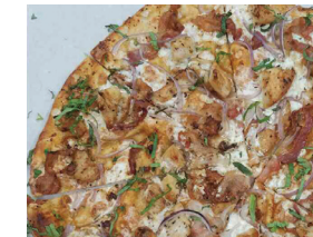
BBQ Grilled Chicken Pizza