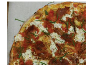
La Napoletana Pizza