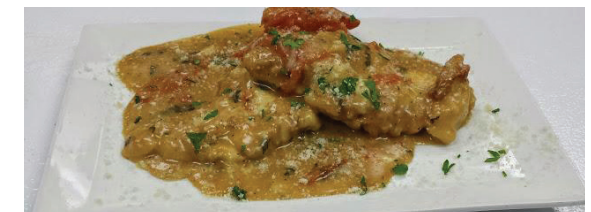
Tomori's Chicken Dish